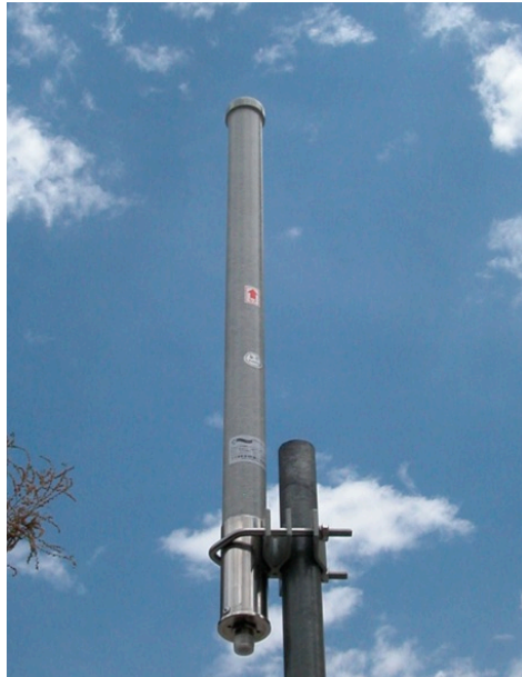
Shipped Direct from Manufacturer

One Year Warranty, Repair or Replacement, Provided by Manufacturer