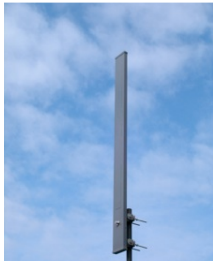
Shipped Direct from Manufacturer

One Year Warranty, Repair or Replacement, Provided by Manufacturer