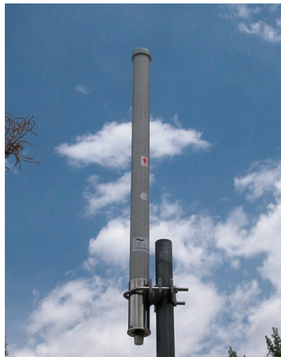
Shipped Direct from Manufacturer

One Year Warranty, Repair or Replacement, Provided by Manufacturer