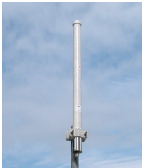
Shipped Direct from Manufacturer

One Year Warranty, Repair or Replacement, Provided by Manufacturer