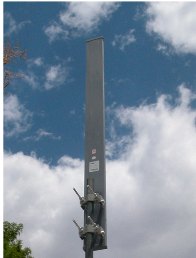
Shipped Direct from Manufacturer

One Year Warranty, Repair or Replacement, Provided by Manufacturer