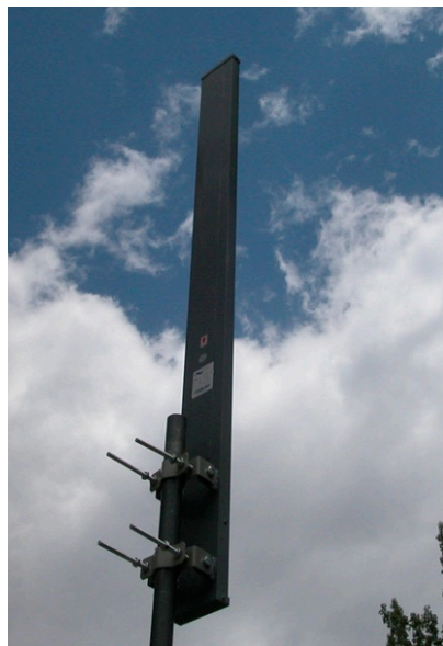
Shipped Direct from Manufacturer

One Year Warranty, Repair or Replacement, Provided by Manufacturer