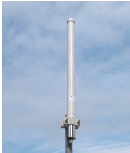
Shipped Direct from Manufacturer

One Year Warranty, Repair or Replacement, Provided by Manufacturer