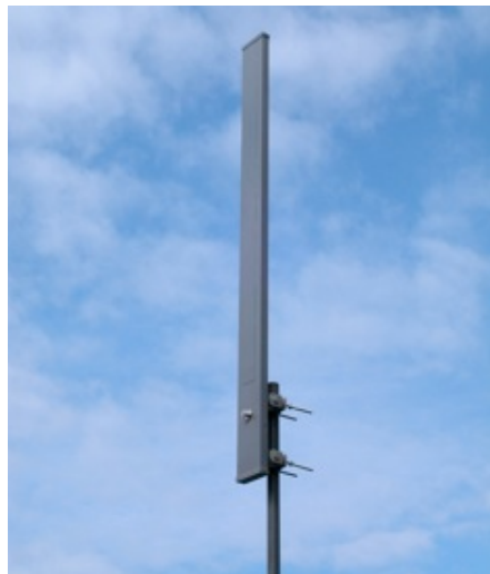
Shipped Direct from Manufacturer

One Year Warranty, Repair or Replacement, Provided by Manufacturer