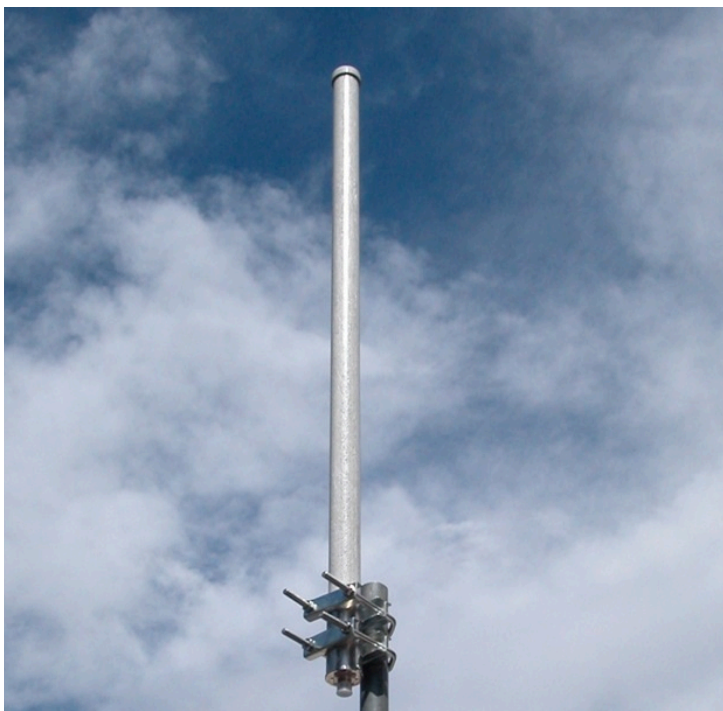
Shipped Direct from Manufacturer

One Year Warranty, Repair or Replacement, Provided by Manufacturer