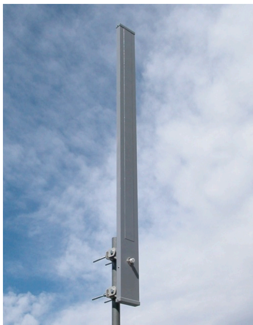
Shipped Direct from Manufacturer

One Year Warranty, Repair or Replacement, Provided by Manufacturer