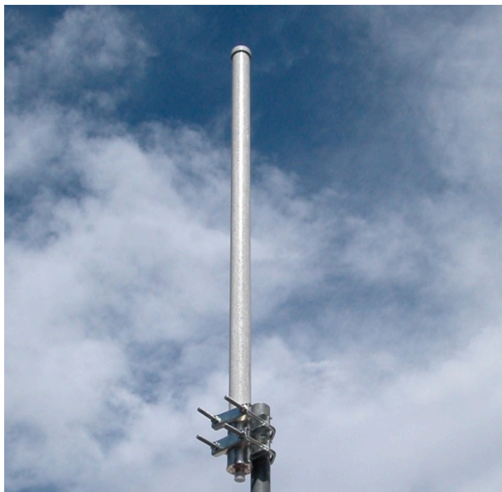
Shipped Direct from Manufacturer

One Year Warranty, Repair or Replacement, Provided by Manufacturer