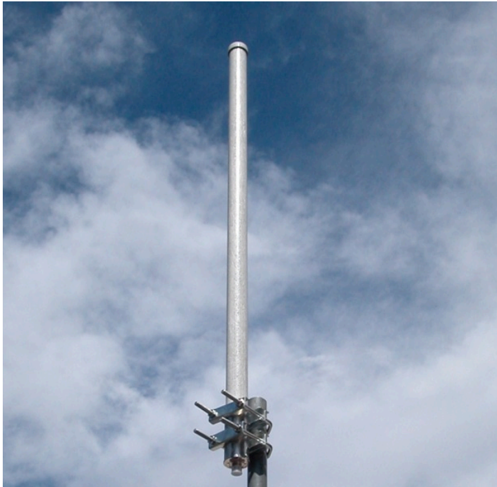
Shipped Direct from Manufacturer

One Year Warranty, Repair or Replacement, Provided by Manufacturer