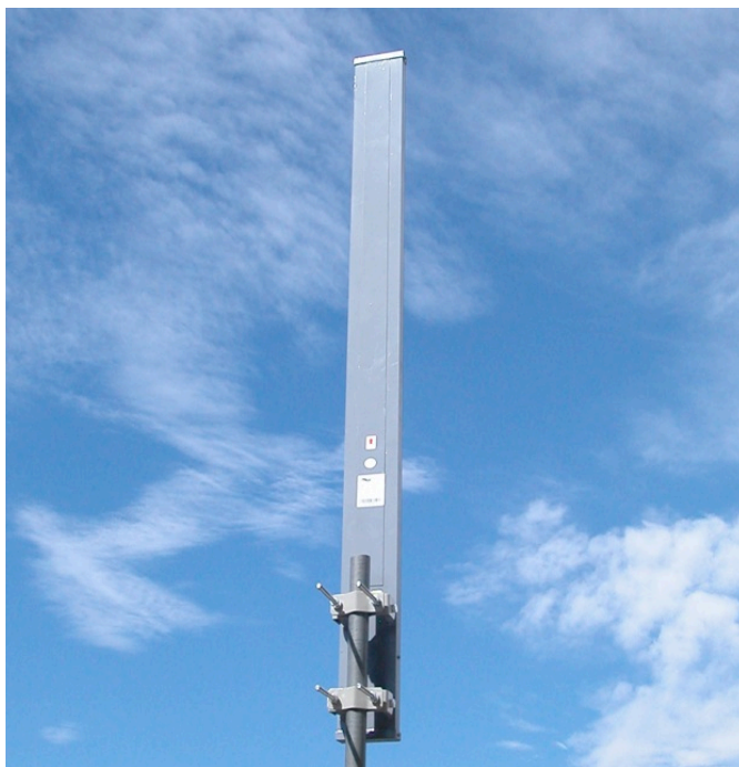
Shipped Direct from Manufacturer

One Year Warranty, Repair or Replacement, Provided by Manufacturer