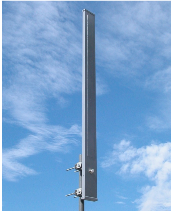
Shipped Direct from Manufacturer

One Year Warranty, Repair or Replacement, Provided by Manufacturer