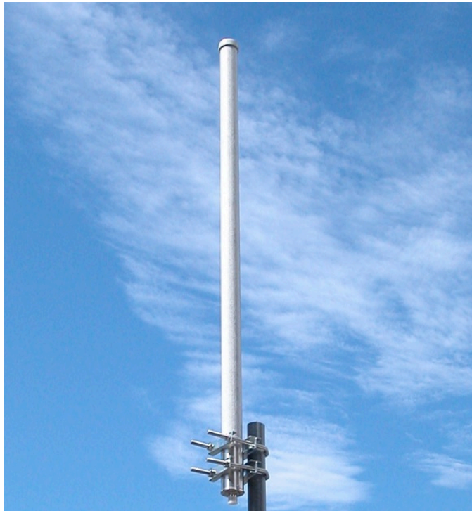
Shipped Direct from Manufacturer

One Year Warranty, Repair or Replacement, Provided by Manufacturer