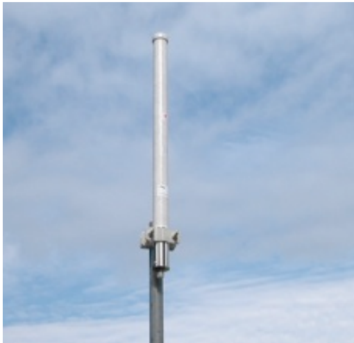
Shipped Direct from Manufacturer

One Year Warranty, Repair or Replacement, Provided by Manufacturer