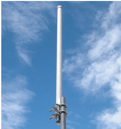
Shipped Direct from Manufacturer

One Year Warranty, Repair or Replacement, Provided by Manufacturer